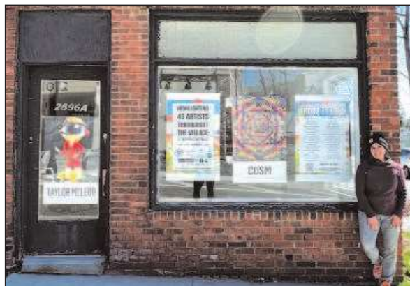
Forty-three artists are participating in the art banner project by Wappingers Rises in the Village of Wappingers Falls. The project is scheduled to run through November.

The next open call is still to be determined, said Urciuoli Kolb. It is hoped to be January 2024.